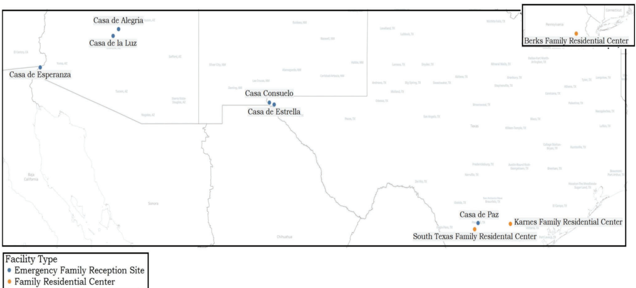
Figure 1. Hotels Endeavors opened as part of its contract with ICE to house migrant families.

If contracts do not meet one of the criteria, they must be awarded through an open competitive process. The contract with Endeavors included the use of six hotels, 4 which were repurposed as Emergency Family Reception Sites (see Figure 1), 5 set up to accommodate migrants for stays typically lasting less than 3 days 6 while ICE considered conditions of release based on specific circumstances, including alternatives to detention. 7