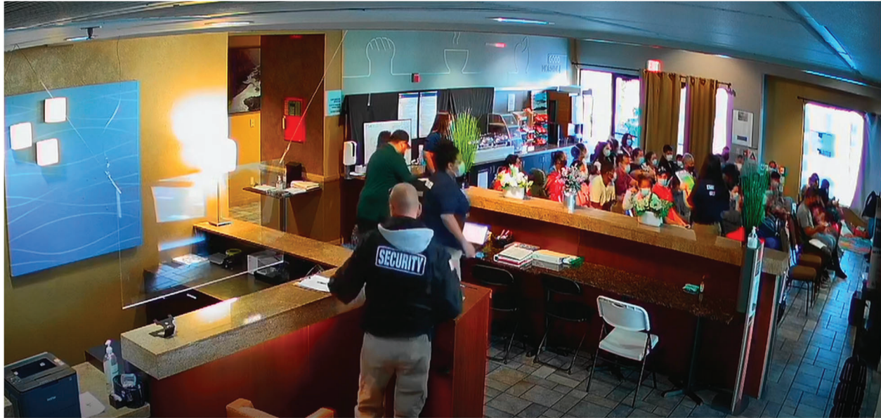
Figure 2. Migrants waiting to be processed at an ICE hotel in Phoenix, Arizona, in May 2021.

In March 2021, ICE modified its FRS 8 to establish guidelines for housing and caring for migrant families held in ICE custody at hotel locations operated by Endeavors, as pictured in Figure 2. The standards were customized for hotel locations to reflect that hotels are not intended to provide long-term residential care. The modified FRS kept some of the required standards intact but modified or removed several key standards that were not useful or appropriate for short-term stays. 9