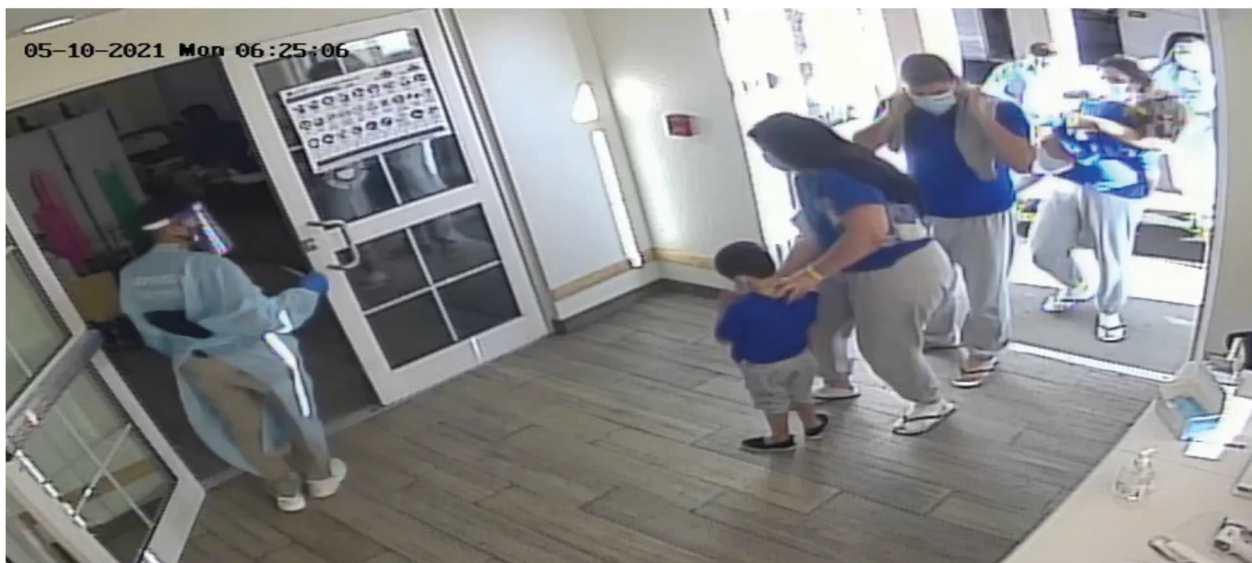
Figure 4. Migrants arriving at an ICE hotel in El Paso, Texas, in May 2021.