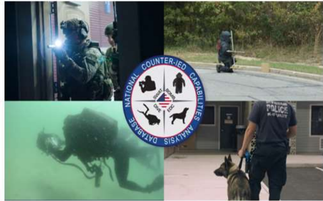
Figure 1. First Responder Special Units

As part of its mission, OBP is also responsible for assessing the C-IED capabilities at the national level for first responder special units, such as bomb squads, explosives detection canine teams, dive teams, and special weapons and tactics (SWAT) teams throughout the United States (see Figure 1). OBP is responsible for systematically identifying and assessing capabilities through its National C-IED Capabilities Analysis Database (NCCAD). The database is designed to provide a snapshot of the Nation's C-IED preparedness by collecting information about personnel, equipment, and training required to better understand C-IED capabilities. NCCAD is also intended to provide decision makers with a comprehensive overview of C-IED capabilities that can be used to influence policy, assign resources, and respond to emerging IED threats.